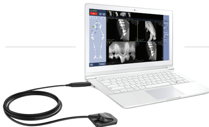
EzSensor Vet Series | Intraoral Sensors EzDentVet | Vet Dental Imaging Software