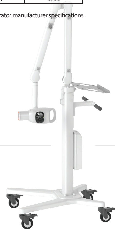
EzRayVet Cart | Mobile X-Ray System