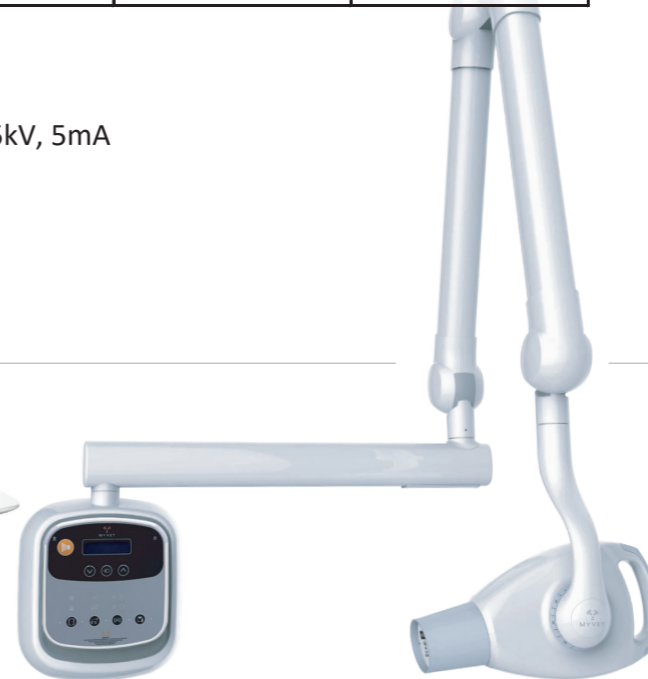
EzRayVet Wall Mount X-Ray System